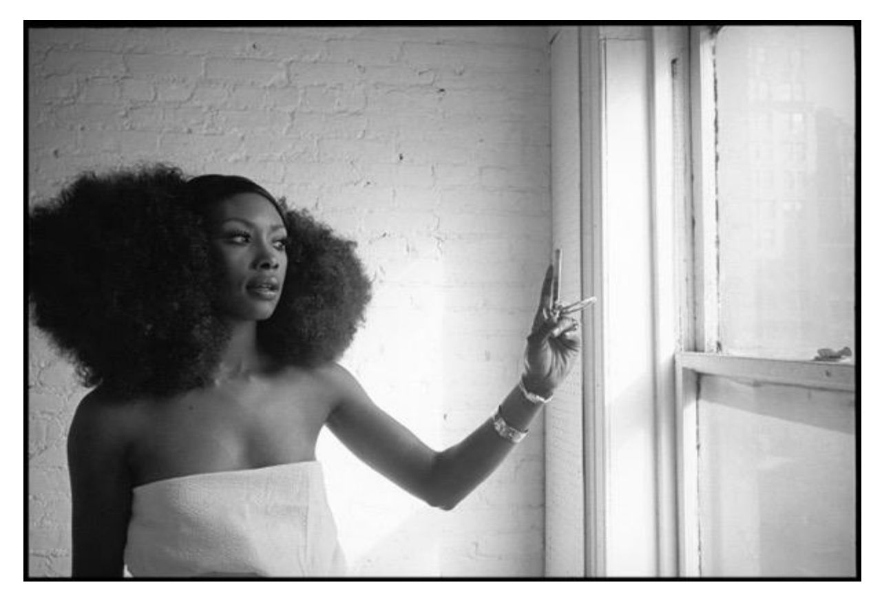
Eve Arnold A model in Harlem, New York City in 1968.

20x24" Archival pigment print, estate-stamped on reverse Edition of 21