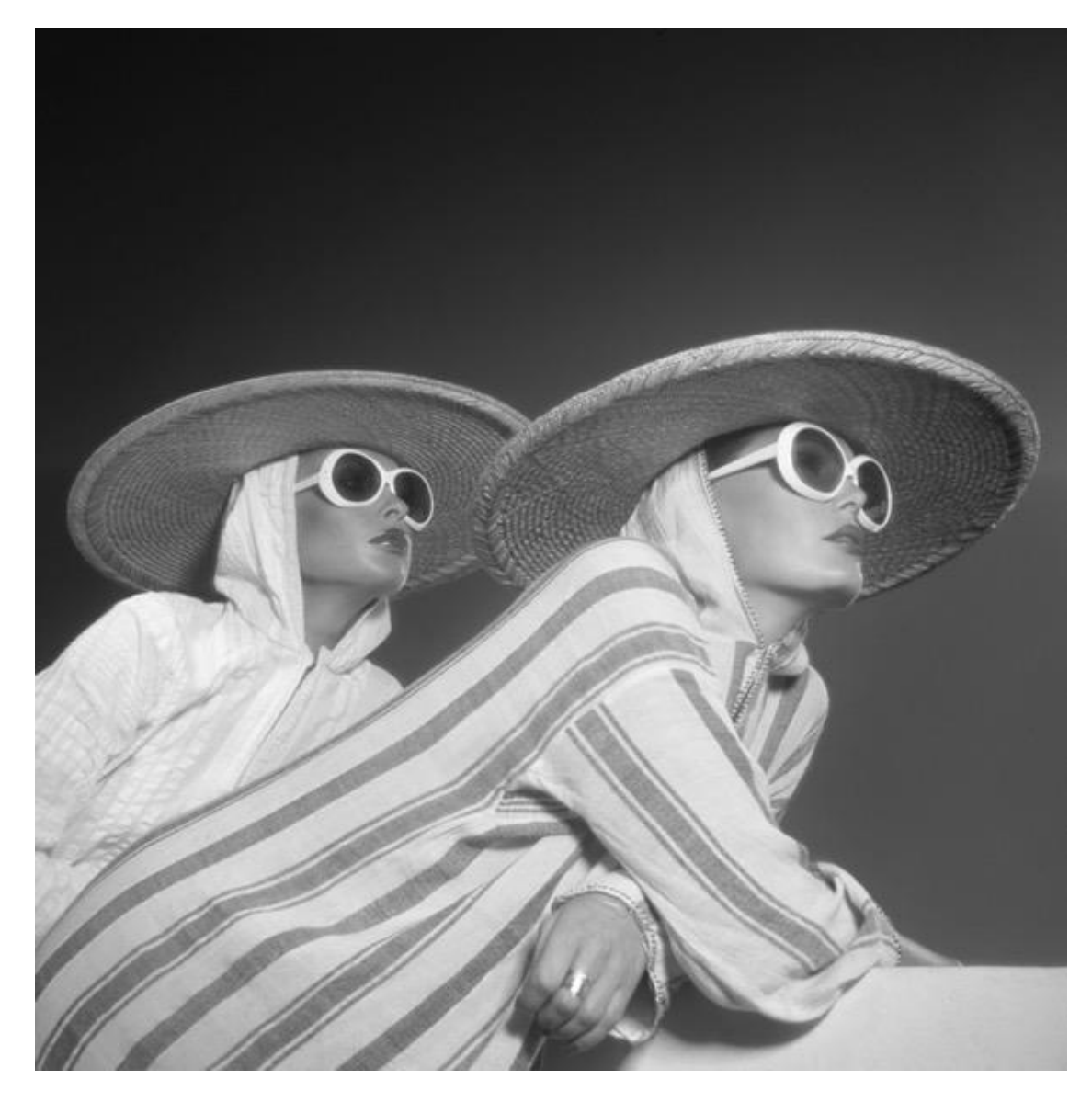
Willie Christie Hats & Glasses, Antalya, Turkey, 1975

24x24" Archival pigment print, signed and numbered by Willie Christie Edition of 20